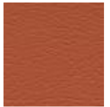
291-8233 Autumn Leaf