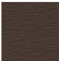
291-3205 Hot Chocolate