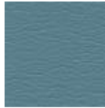
291-2507 St. John