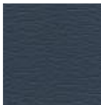
291-2478 Diplomat Blue