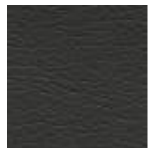
291-5607 Raven Wing