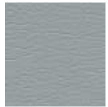
291-5666 Dove Grey