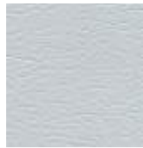
291-5668 Silver Pearl