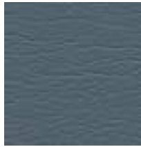
291-2508 Rain Dance