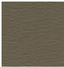
291-3183 Pine Cone