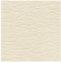
291-3720 Light Oyster