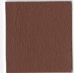
PR 42 Rose Blush