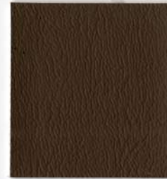
PR 38 Harness