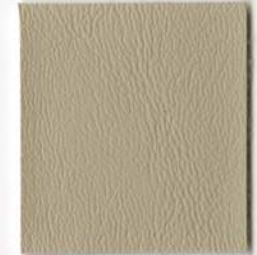
PR 35 Fawn