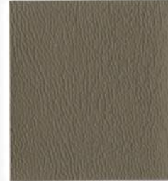
PR 51 Cocoa