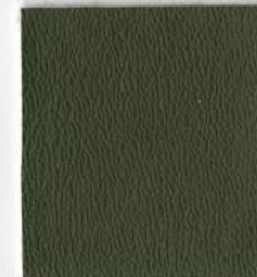
PR 53 Ivy