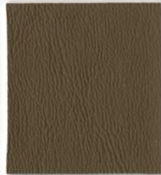
PR 43 Velvet Brown