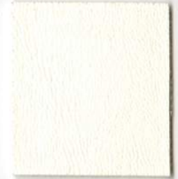
PR 34 Soft White