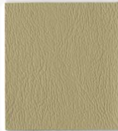
PR 48 Doeskin