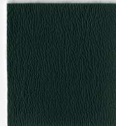
PR 39 Laurel