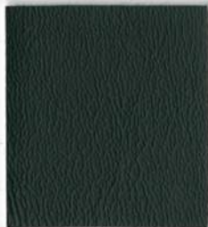
PR 49 Deep Sea