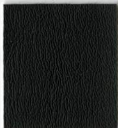
PR 40 Black Satin