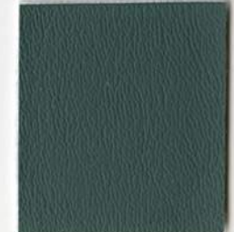
PR 45 Mint Leaf