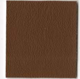
PR 52 Saddle