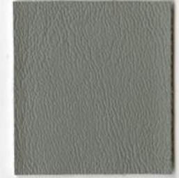
PR 37 Feather