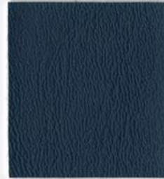
PR 54 Mallard Blue