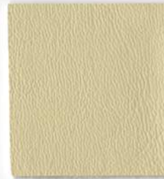
PR 44 Cream