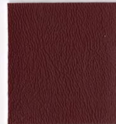
PR 47 Tapestry Red