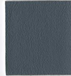
PR 46 Blue Fog