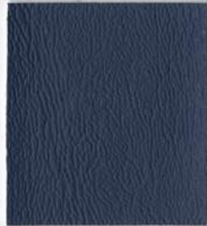
PR 50 Lake Louise