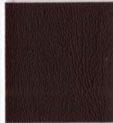
PR 36 Cabernet