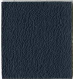
PR 55 Deep Sapphire