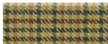
Granny Smith 1011805