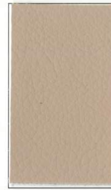
Ballet Slipper QEN-002